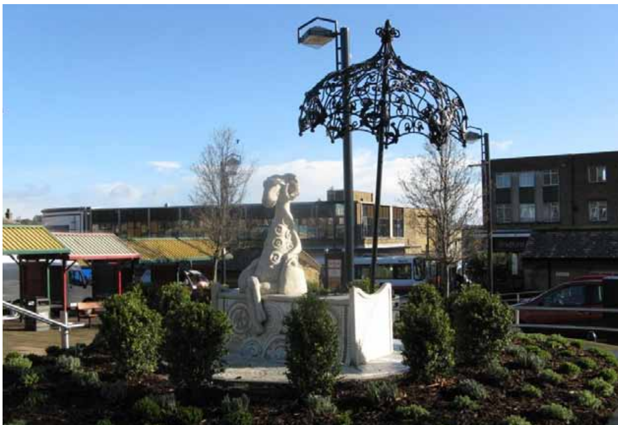
Shipley Town Centre